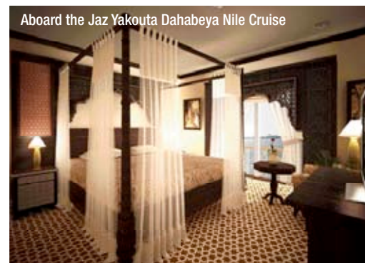
Aboard the Jaz Yakouta Dahabeya Nile Cruise

The 24,000 employee-strong Travco force has also teamed up with Stiegenberger Hotels and Resorts and sister-company InterCityHotel. So their portfolio now includes an extra 78 hotels across Egypt, Germany, Austria, Switzerland and the Netherlands. Completing their travel, tourism and hospitality empire is Air Arabia, the Middle East's first low-cost air carrier and Prestige Cars limousine service. Constantly developing and growing since its inception in 1979, the premier Egyptian company has ventured into resort development. Almaza Bay in Marsa Matruh promises to bring vibrancy, luxury and comfort to a largely unspoiled stretch of Egypt's Mediterranean coast, while Madinat Makadi on the Red Sea promises to be a lavish affair. Each new development will be fully equipped so that